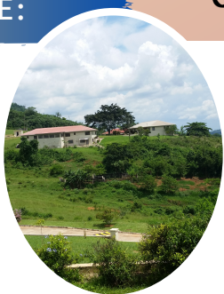
THE JAMAICA DEAF VILLAGE: AN OASIS