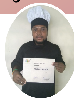
WHAT'S UP AT CCCD MONTEGO BAY?