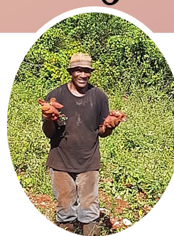
WHAT'S UP AT CCCD KNOCKPATRICK?