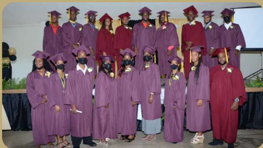
Graduating Class of 2021

CCCD Montego Bay hosted its first graduation in 3 years on December 2, 2021 at a beautiful face to face ceremony with COVID 19 protocols adhered to, of course! Twenty-two (22) students graduated. The theme for the ceremony was 'Dream Big'.