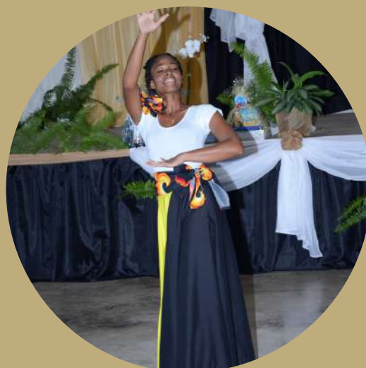
Performance from CCCD Montego Bay's Dance Group.