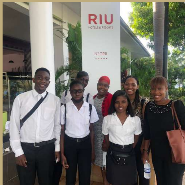
CCCD Montego Bay students and staff members attending a recent Sensitization Session on the Disabilities Act at the RIU Hotel in Negril.