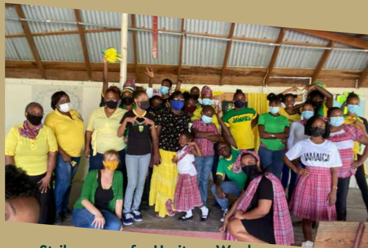
Strike a pose for Heritage Week.