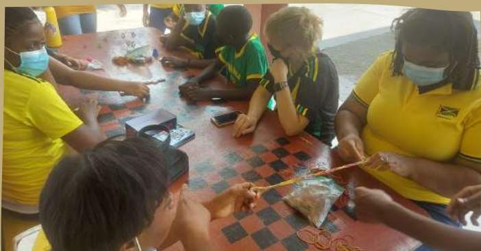
Games Day: playing dominoes and making "rope" with rubber bands for Chinese skip (Jamaican favourites).