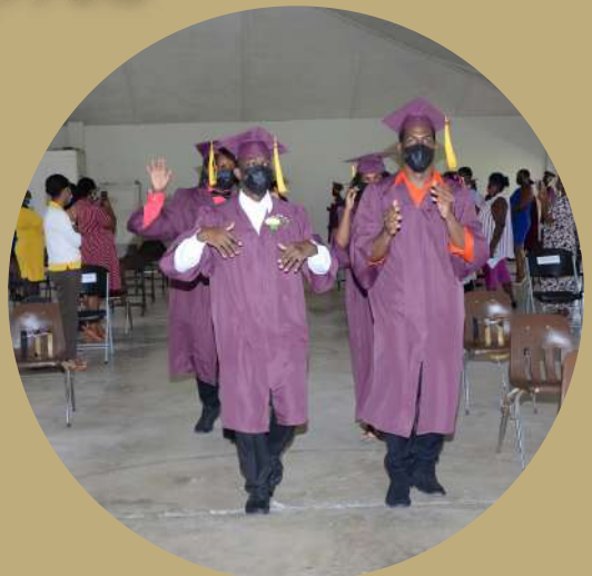
Some of our proud graduates!